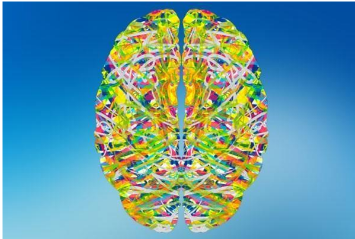
Art image designed by "Anne Labovitz"